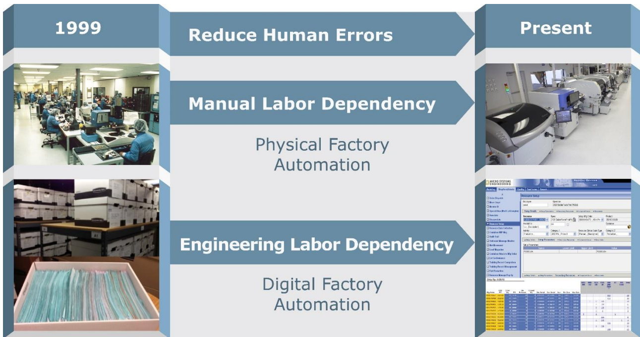
Figure 1. A look at manufacturing automation, past and present, details an evolution from a manual, paper-driven process to one defined by machines and digital file storage and analysis.

The physical factory refers to the actual equipment, tooling, and aids for manufacturing on the factory floor. Physical factory automation enforces workmanship standards by avoiding anomalous handling, and imposing both strict recipe management and tight process control. Automated test and inspection methods can provide repeatable, quality relevant data. Consequently, an automated physical factory can proactively address product quality and improve dependency on direct labor.